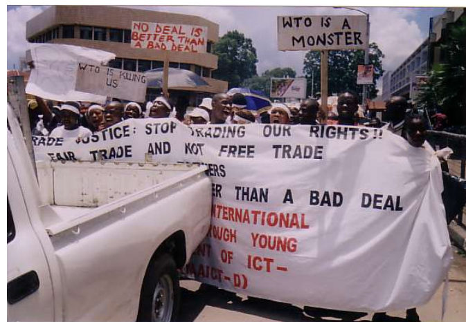
This is how it was during the match.